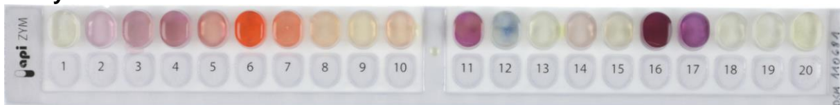
Abbildung 2: Apizym-Teststreifen mit Keim DSM.