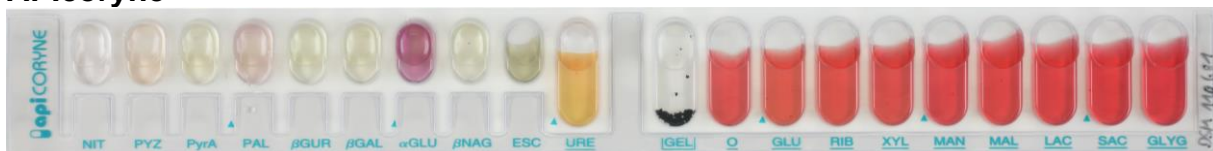
Abbildung 1: Apicoryne-Teststreifen mit Keim DSM.