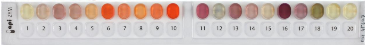
Abbildung 2: Apizym-Teststreifen mit Keim DSM.