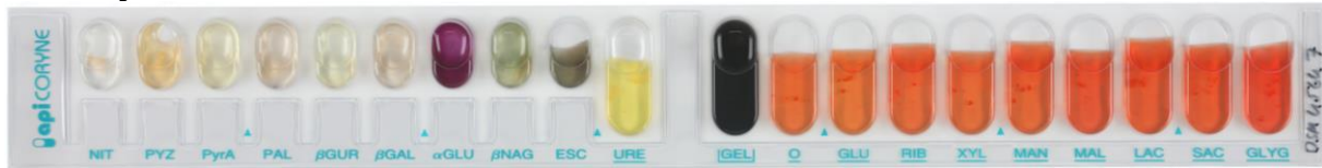
Abbildung 1: Apicoryne-Teststreifen mit Keim DSM.